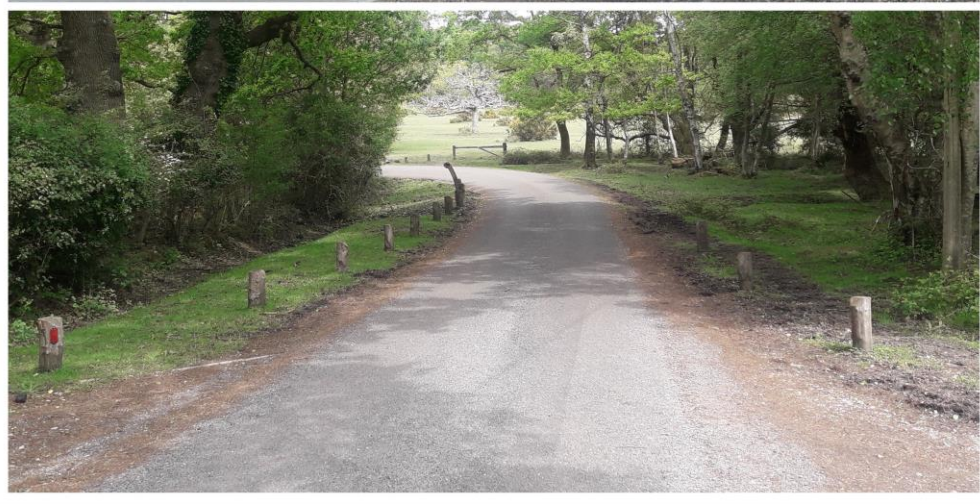
Verge restoration, before and after.